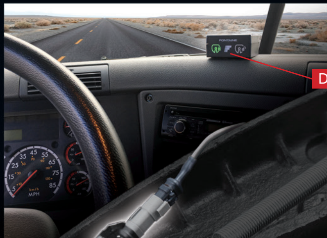
Dashboard Visual Indicator

An additional check to help protect your equipment and cargo